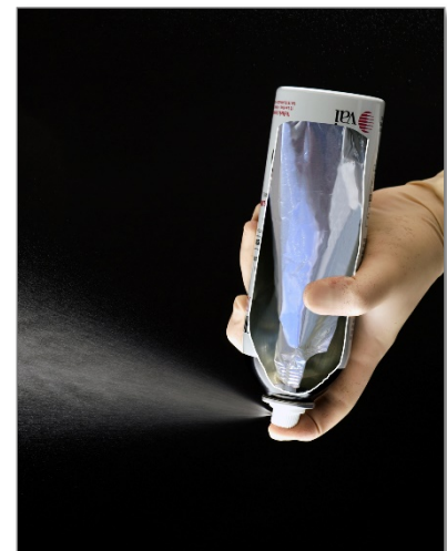
325 mL Aerosol “Inverta Spray” DECWFI-SP-70-B-E