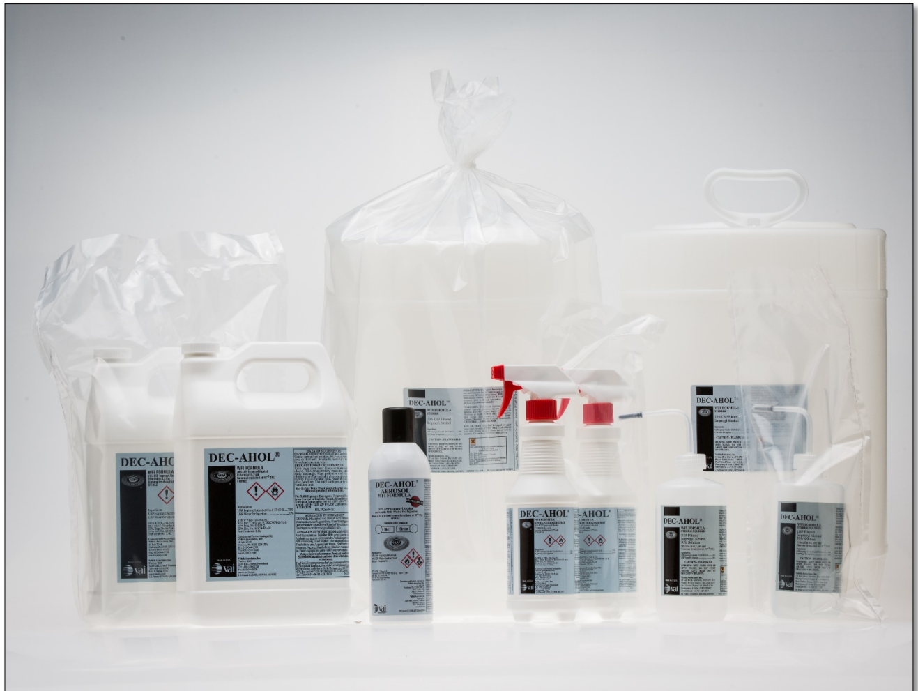
DEC-AHOL WFI Formula Family of Products

(Any specific product label is available upon request.)